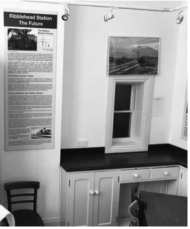
The interior of RVC. We plan to reinstate the booking office window to its original form and to instal an Edmondson date stamp machine and ticket rack.