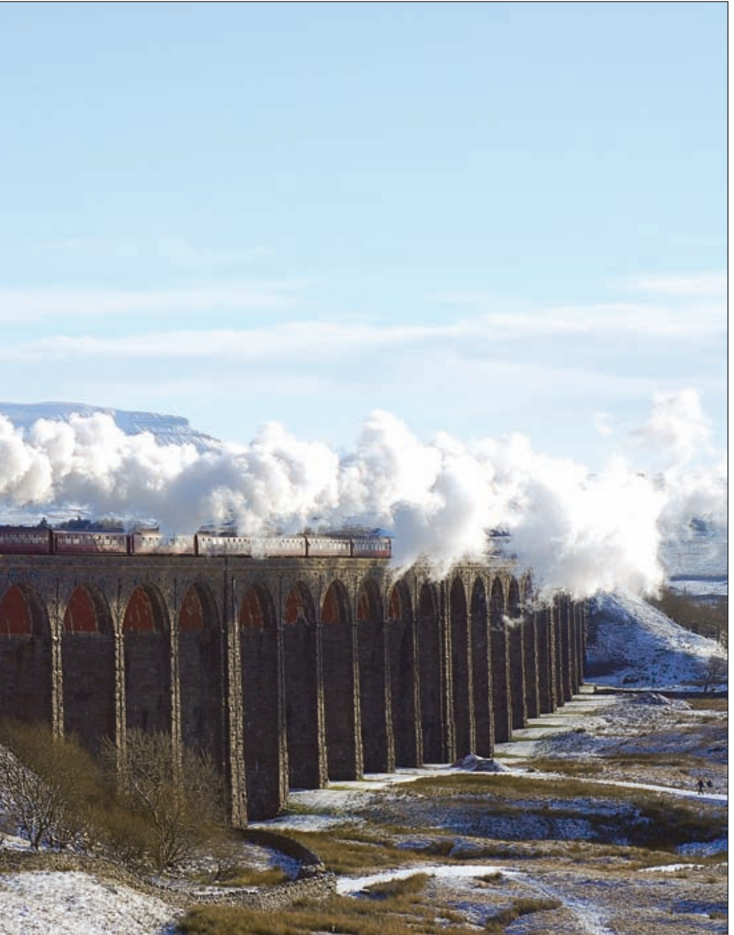
to Carlisle. 27th November 2010.