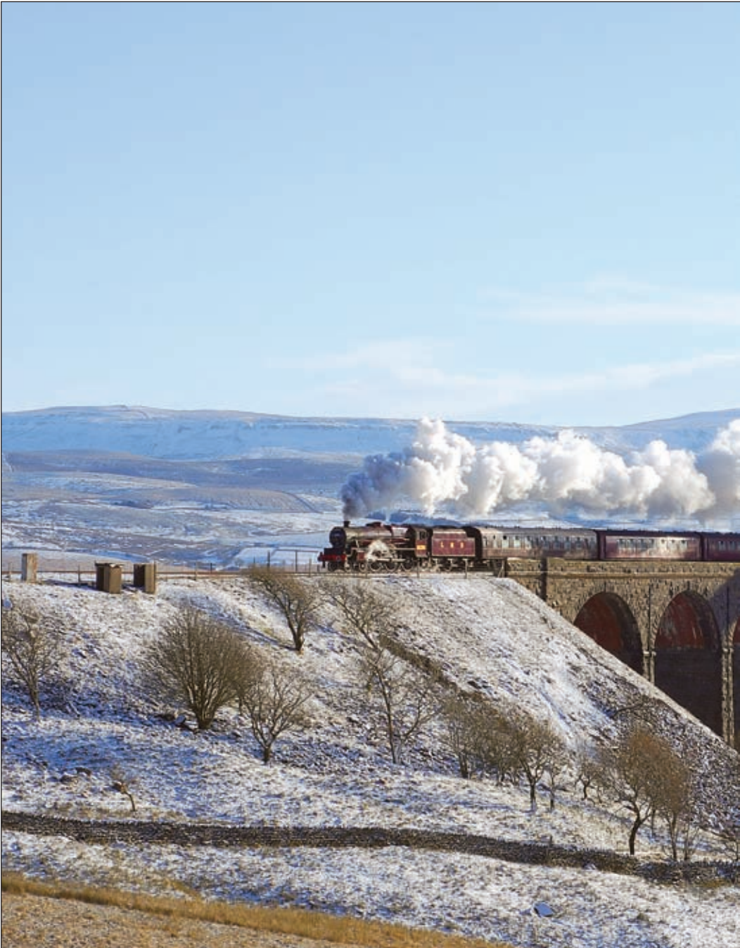
Above: 5690 'Leander' crossing Ribblehead Viaduct with 'The Christmas Fellsman' from Lancaster to