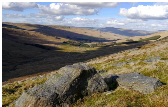
A strenuous walk from Dent to Ribbleshead via Snaizholme.

This year there were 31 walks on the programme. As usual there was a mix of the very strenuous – High Cup Nick, Wild Boar Fell, the Three Peaks, Snaizholme; lots of moderate 6 to 10 mile walks and some very popular tours round Giggleswick School Chapel, Settle Watertower & Signal Box and Appleby Castle & Town Trail.