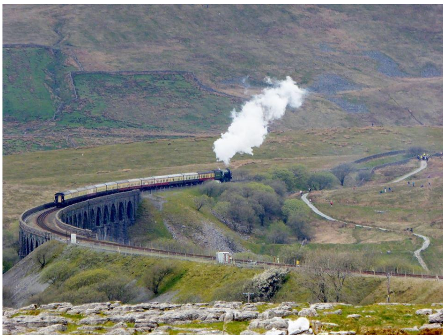
Steam on Ribblehead Viaduct.