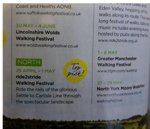
Ride2stride was Country Walking magazine's Top Pick!

Walkers were asked who had travelled by train and the majority had, with 75% of people telling us they had travelled on the line at some point during the festival. The large numbers staying in Settle this year were already there for walks from Settle station but used the train when walks started further up the line. On the day of the strike most walkers travelled to Garsdale by car.