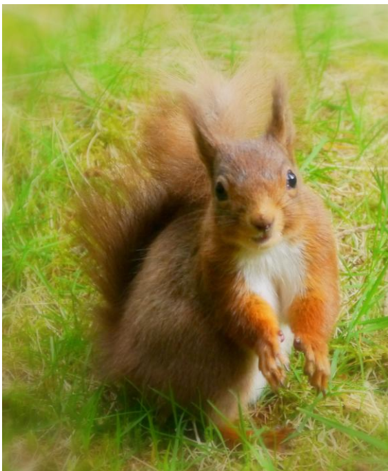
Red Squirrel at Snaizholme.