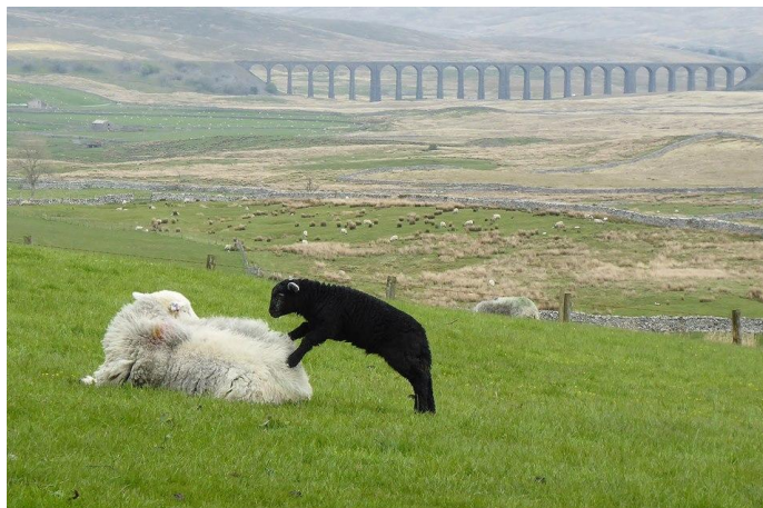
Play with me Mum.