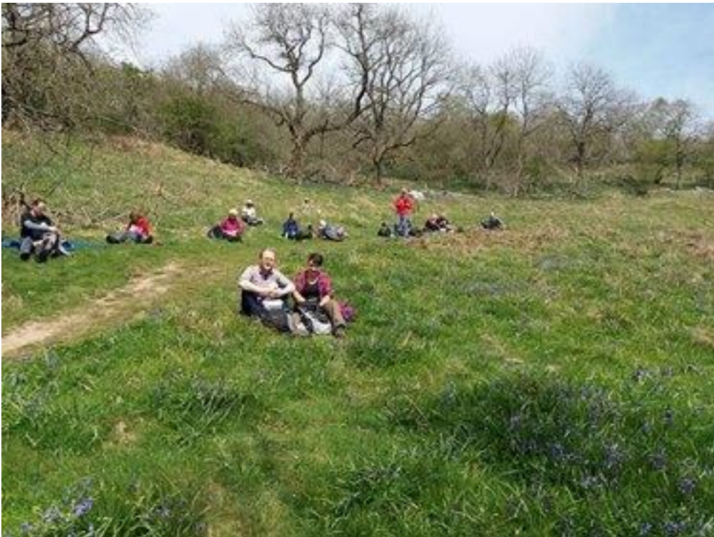
Lunch in Oxenber Woods on a sunny Bank Holiday Monday 2017

A week of walks, talks and music along the Settle to Carlisle railway line