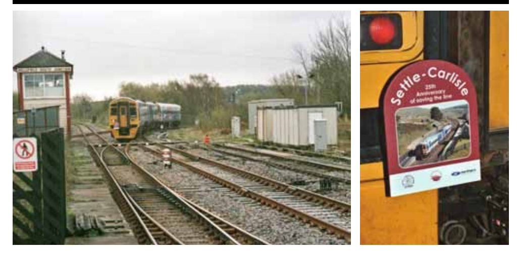
Above: 158.905 + 153.360 come up the Lancashire line from Blackpool into Hellifield. Above Right: The headboard.