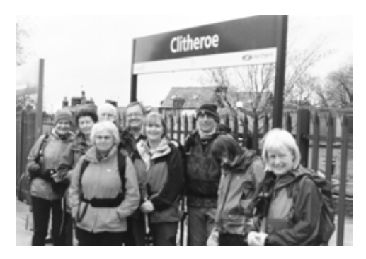
Having just alighted from the Preston train at Clitheroe, the group prepare for the walk back to Hellifield.

change, we have devised a similar walk for 5th October, from Clitheroe to Long Preston