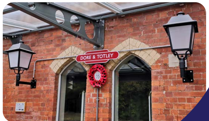
Dore & Topley